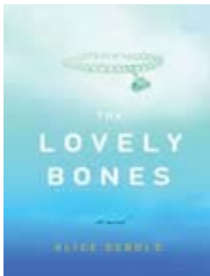
Lovely Bones by Alice Sebold is a must-read book this month!

The book Lovely Bones by Alice Sebold tells the story of Susie Salmon, a girl that was murdered in a small rural city. She is looking down from heaven, and will not let her family go. She watches her family struggle through the effects of her death. They try to find the killer, and Susie continues to watch over them. It's a must read!