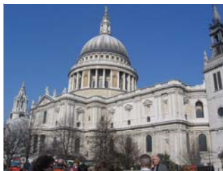
St. Paul's Cathedral, London