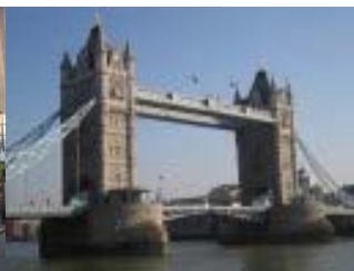
Tower Bridge, London