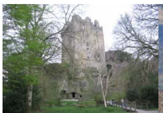
Blarney Castle, Ireland