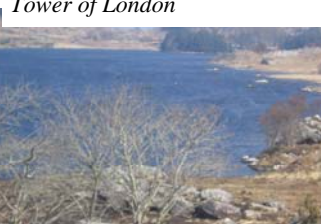
Ring of Kerry, Ireland