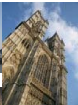
Westminster Abbey, London