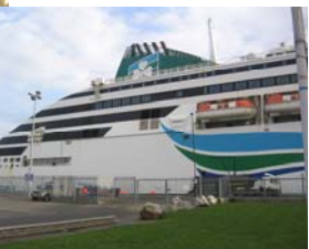
Irish Ferry (our transportation from Wales to Ireland)