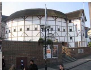
Replica of Shakespeare's Globe Theater, London