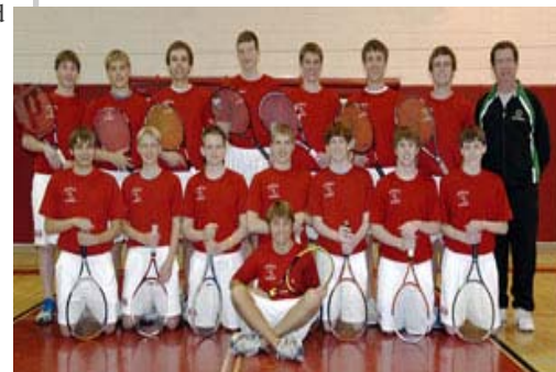
The 2006-07 Boy's Tennis Team!