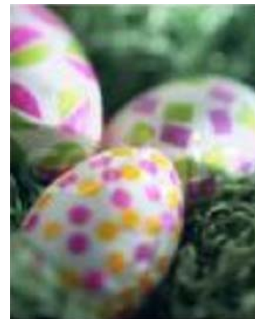
Easter eggs can be decorated using many different shapes and colors as demonstrated.

write) eggs were created by carefully applying wax in patterns to an egg. The egg was then dyed, wax would be reapplied in spots to preserve that color, and the egg was then boiled again in other shades. The result was a multi-color striped or patterned egg. In addition to Easter eggs, hares and rabbits have also been significant symbols of fertility. The inclusion of the hare into Easter customs appears to have originated in Germany, where tales were told of an "Easter hare" who laid eggs for children to find. German immigrants to America -- particularly Pennsylvania -- brought the tradition with them and spread it to a wider public. They also baked cakes for Easter in the shape of hares, and began the practice of making chocolate bunnies and eggs. As demonstrated above, there are many different traditions practiced by people throughout