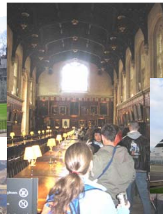
Christ Church College at Oxford. Also the Great Hall in the Harry Potter movies.