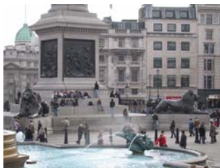
Trafalgar Square, London