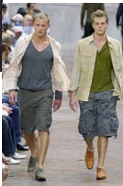
Shorts worn in "the careless look" is very popular this Spring!

The dress was popular, is popular, and always will be popular. The black dress is a special dress that you can wear for all different occasions. You can wear the black dress to school; if the weather is good you can go outside and you can even wear the dress to a party! If the black dress is not your style it is possible to choose a happy color, maybe with a nice print! This spring the flower print is back. The romantic girly dress is perfect for this spring. It is best worn just above or just under the knee. To finish the look you can