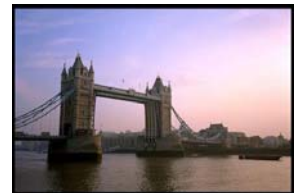
The London Bridge is falling down!

As you can see, there will be no shortage of fun. Check back in the Red Hat after spring break for a review of the trip and hopefully, some interesting (or, more likely, silly) stories!