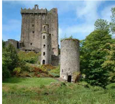
The Blarney Castle in Ireland is one of the many sites rich in Irish tradition that we will be visiting. Kissing the Blarney stone will definitely be the highlight of this excursion!

So you can relax during Spring Break, what follows