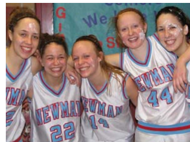
The Seniors enjoy Senior night.

Thanks again, Newman Girl's Basketball Seniors