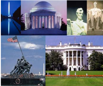
One of the most exciting spots to spend spring break is in Washington, D.C. where you can view some of the greatest national monuments.

“...according to local forecasters, there are only a couple of days left until spring hits full force!”