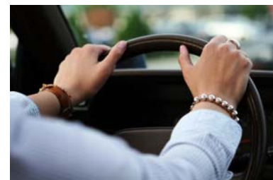
Always drive with two hands on the wheel!