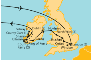
A map of our journey to England, Ireland, and Wales!