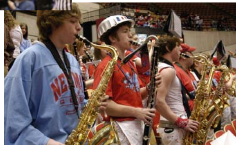
The Pep Band plays at State.