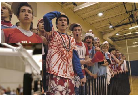
Fans hold on to their hats as they cheer on the Cards!