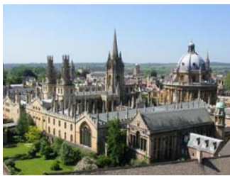
The world renowned Oxford University.